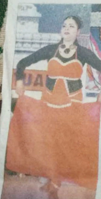
सीए के वार्षिकोत्सव में भाग लेती व्यती।

चार्टर्ड एकाउंटेंट्स ऑफ इंडिया की गाजियाबाद ब्रांच ने मनाया वार्षिकोत्सव, मेधावी हुए पुरस्कृत