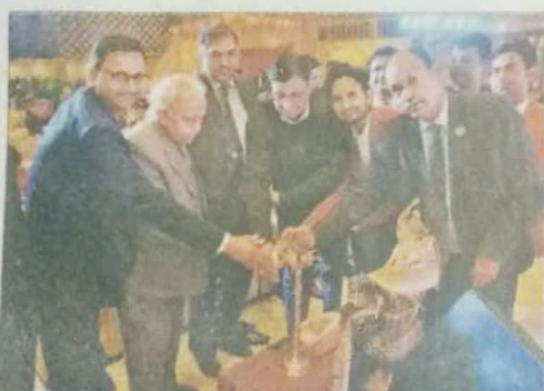
वार्षिकोत्सव का सुभारंभ करते अतिथि।